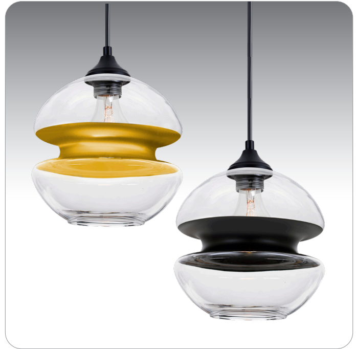
HULA 8 SHOWN IN CLEAR/GOLD (HULA8GD) & CLEAR/BLACK (HULA8BK)

UL or ETL Listed. Suitable for Damp Locations (exterior use under covered ceiling only).