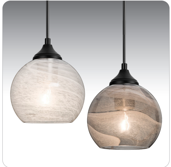
JILLY SHOWN IN CLEAR VAPOR (JILLYCL) & SMOKE VAPOR (JILLYSM)

UL or ETL Listed. Suitable for Damp Locations (exterior use under covered ceiling only).