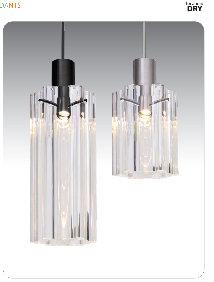
ICE7CL (ICE 7 CLEAR) & ICE4CL (ICE 4 CLEAR)

All dimensions provided are nominal. Allowance must be made for dimensional tolerance in handcrafted glasses.