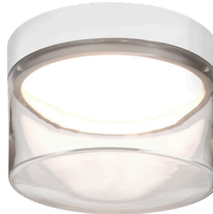
SATIN NICKEL CAP