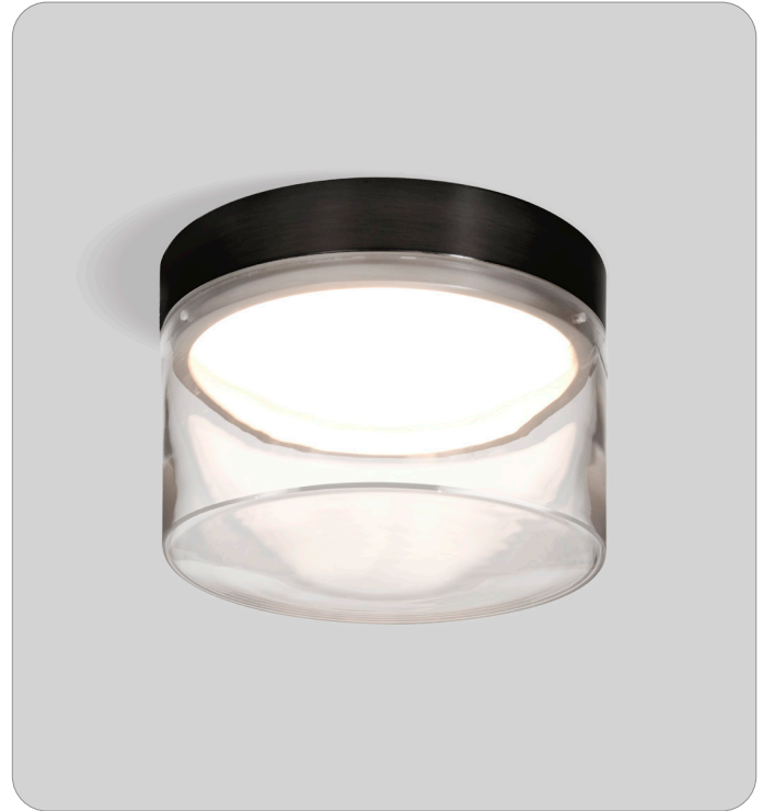
CLEAR WITH BLACK CAP