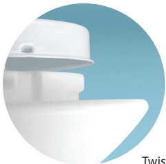
Twist and lock bayonet glass