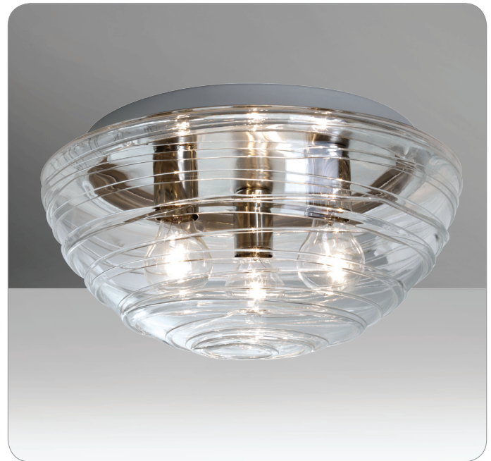
WAVE 15 CEILING SHOWN IN CLEAR (906361C)

UL or ETL Listed. Suitable for Damp Locations (interior use only).