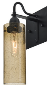
JUNI10PL PLUM BUBBLE