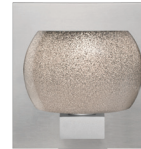
2WF: 14" L