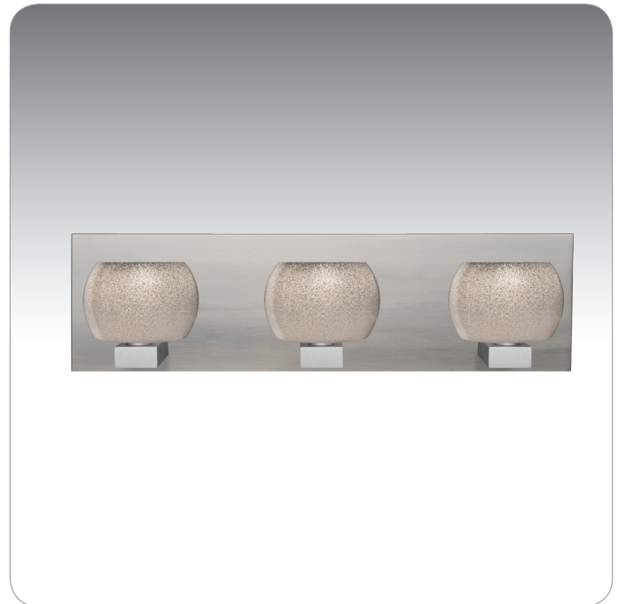
SMOKE SAND (KENOSM)

UL or ETL Listed. Suitable for Damp Locations (interior use only).